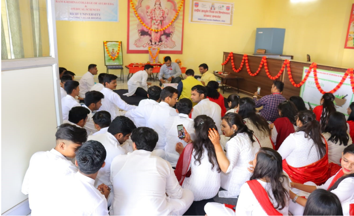
Holy Dhanwantari hawan in presence of staff and students