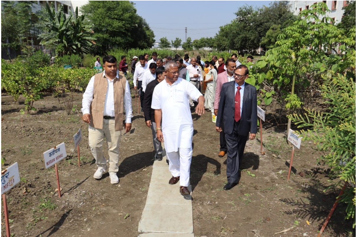
Visit to the Herbal Garden of the institute