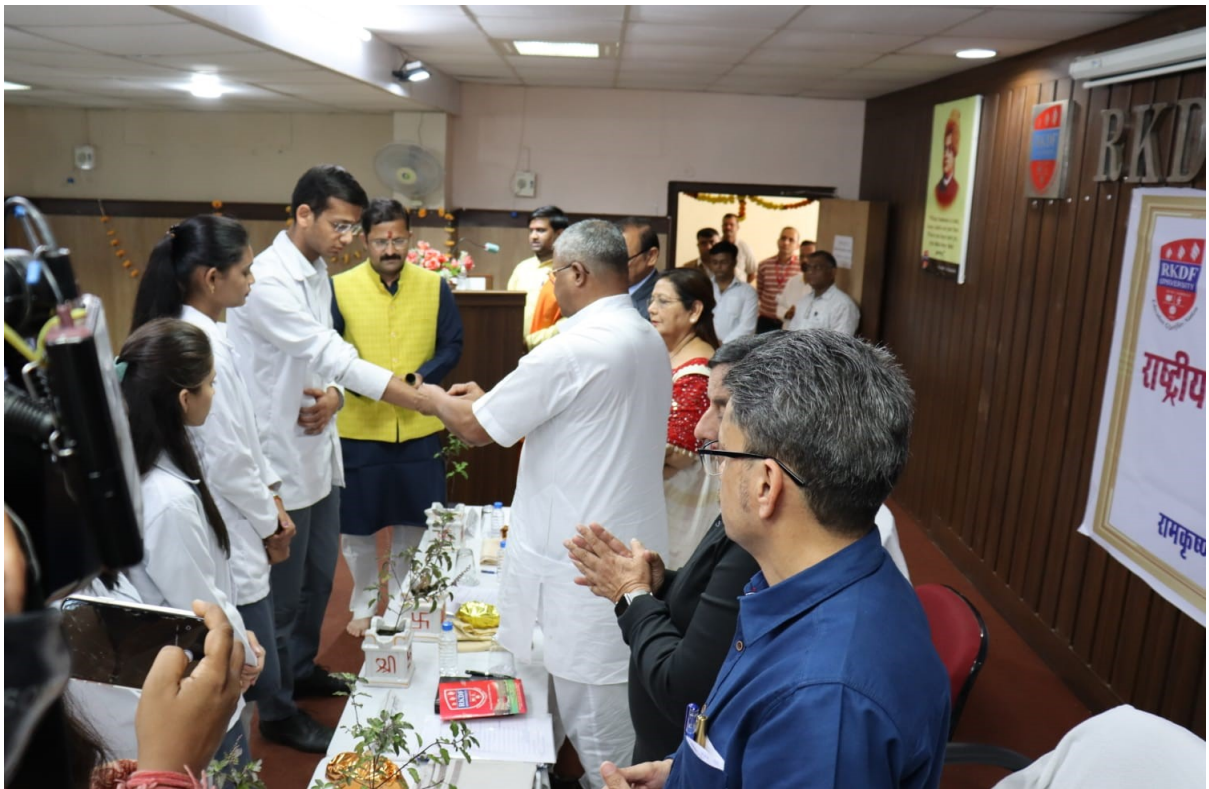
Welcome of students by traditional way of Gurukul Parampara