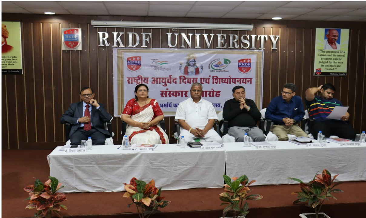
Chief guest with other dignitaries on the dias