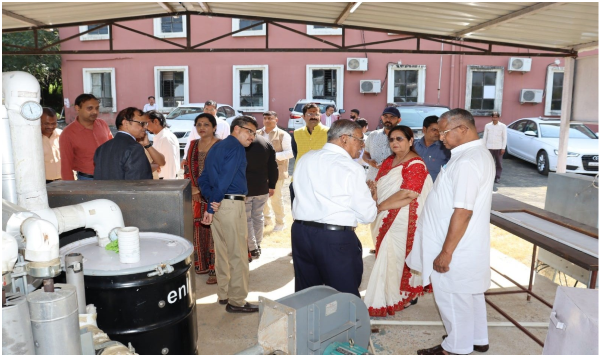
Visit of guests to different research projects of University