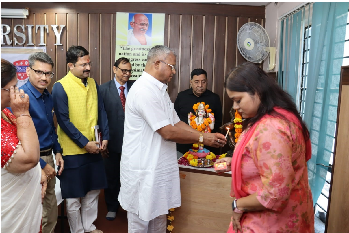
Lamp lightening and dhanwantari Poojan